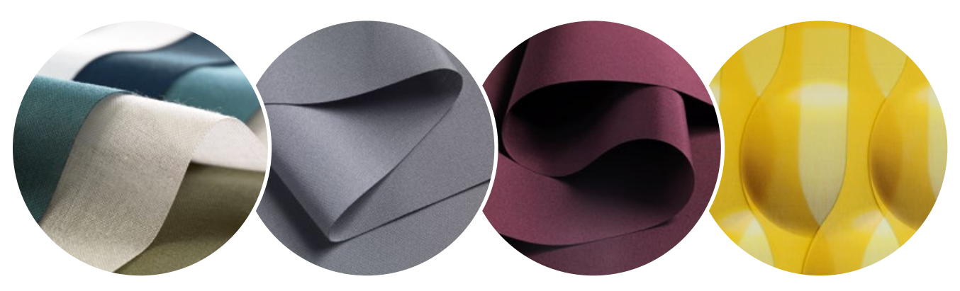
Our exclusive Colorama fabric is available in 30 colours and washable up to 72°

www Check out the Silent Gliss online fabric finder.